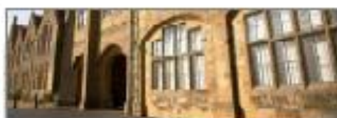
Sherborne School for Girls, Dorset