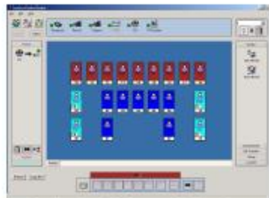
Teacher Control Software and Media Centre

This unique combination of Televic technologies provides a professional interpreting system within a learning environment.