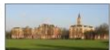
Dulwich College, London