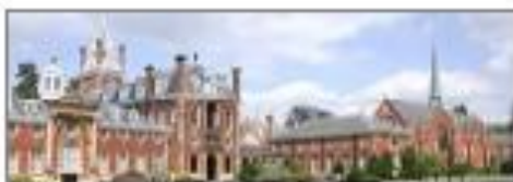
Wellington College, Berkshire